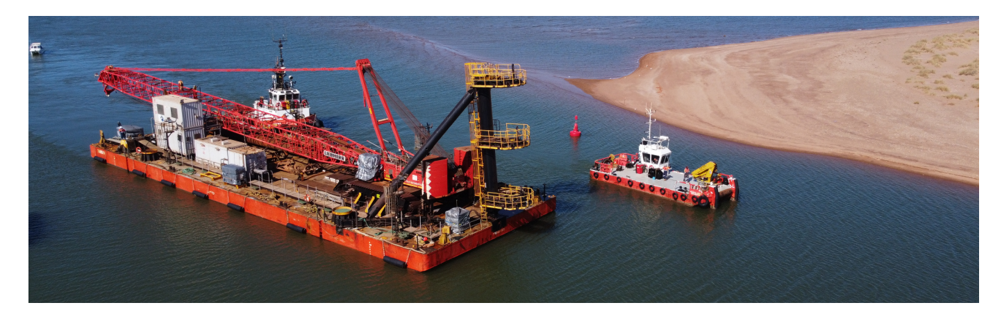
The data on this specification is published in good faith and for general information purpose only. It does not warrant its accuracy or completeness and to the full extent allowed by law excludes liability.