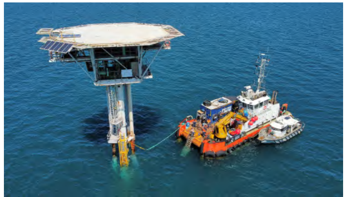
A diverse range of Vessel Charter, Project Support, Construction, Survey, Dredging and Subsea Services Offerings