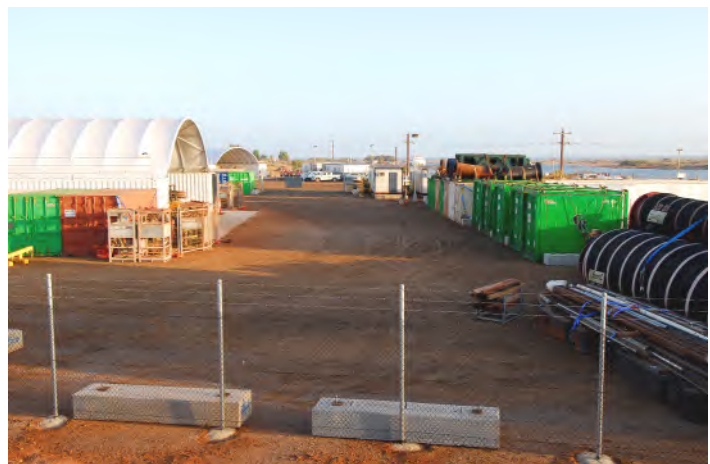
Onslow Shore Base yard and office facilities

The data on this specification sheet has been published in good faith and should be considered for general information purposes only. It does not warrant its accuracy or completeness and to the full extent allowed by law excludes liability.